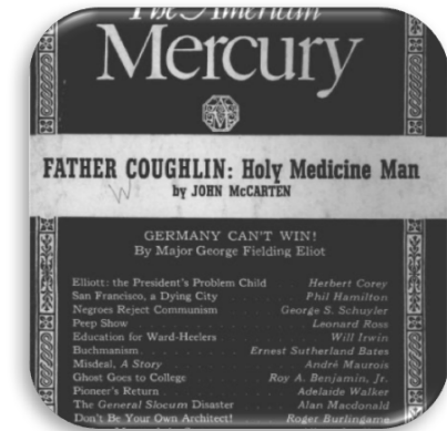
The American Mercury: June 1939